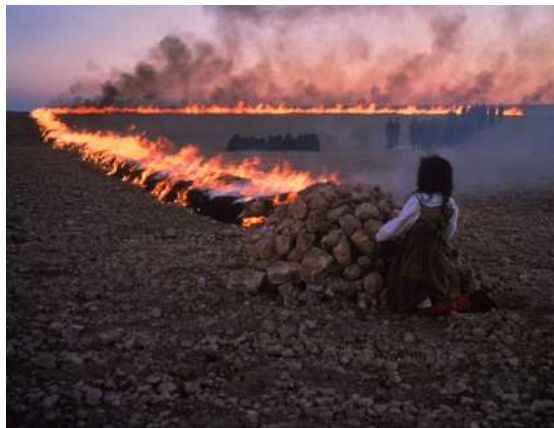
Shirin Neshat: Passage Series, 2001 Production still

Born in Iran in 1957, Neshat emigrated to the United States at age 17 to attend the University of California at Berkeley. In 1986, she returned to Iran for the first of several visits and found the country transformed by the Islamic Revolution. Her resulting sense of displacement and exile inspired her to create works that investigate the collision of tradition and modernity in the East and West within an increasingly globalized world. According to Neshat, she engages in "universal dialogues while keeping within the specificity of the Islamic culture."